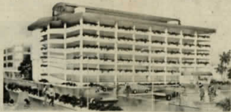
PROPOSED MULTI-STOREY CARPARK FOR SIBIU MUNICIPAL COUNCIL