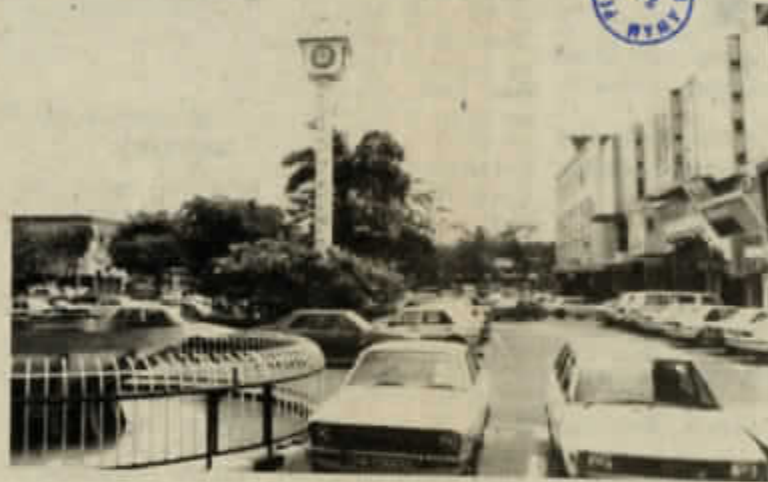
View of the site for the proposed car park building.

But, beginning of next month car-owners who normally park in the area (Wong Nai Siang Road) will have to hunt for parking bays which will add to the congestion in town for at least two years.